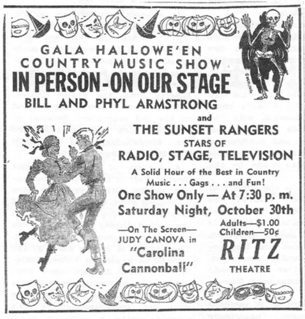
The Greenville Advocate - October 1965

"I know we were at Greenville at Halloween Time," Phyllis recalls. "The stage was full of hay and pumpkins, and the previews were advertising 'Ghostly Stories' as part of the show – just what audiences wanted for Halloween!"