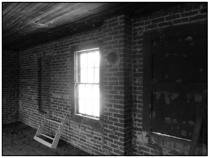
Interior of upper floor, visible: flue for one of four coal burning stoves