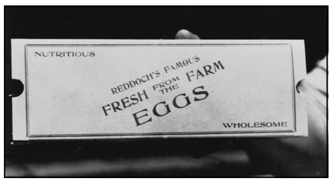
Reddoch Farms egg carton, date unknown

The manufacturer of the incubator has paid the royalty under the Smith patents for 2304 egg capacity, and any increase in capacity will constitute an infringement of said patents.