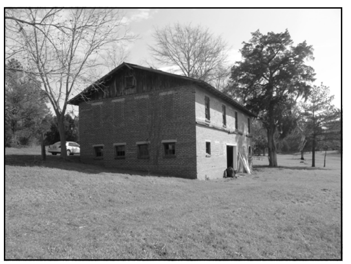
Hatchery building; Southwest view