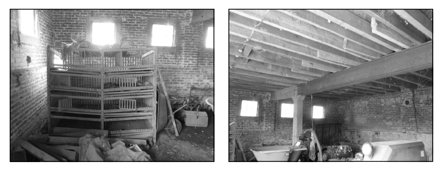
Lower floor view of chicken coops and large steel beam supporting upper floor.