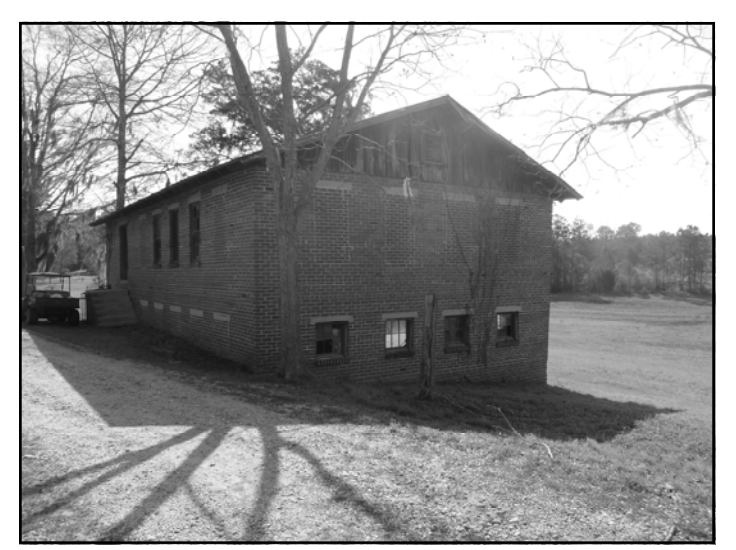
Hatchery building; Northwest view