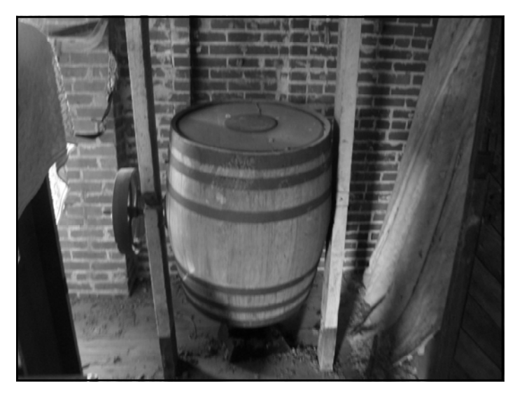
Churn used to produce butter sold in Montgomery, upper floor